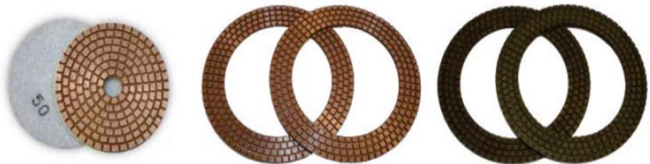
Pictured from left to right: 3N 4 inch copper pads, 7 inch copper rings, 7 inch HP rings